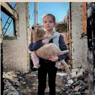
A girl standing with her cat on the doorstep of her burned-out house, Chernihiv region.